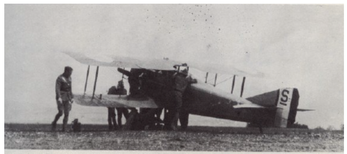
Capt. BROOKS makes a forced landing after engine trouble. Now being repaired, the SPAD is ready for take-off and more service at the Front.